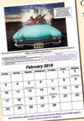
Calendars created by the UPMC Hillman Cancer Center at UPMC Passavant, were given away.