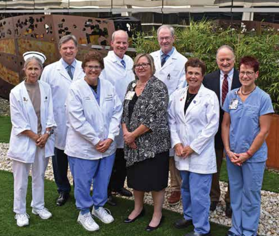
Congratulations to our 2017 Legacy of Caring Gala honorees.