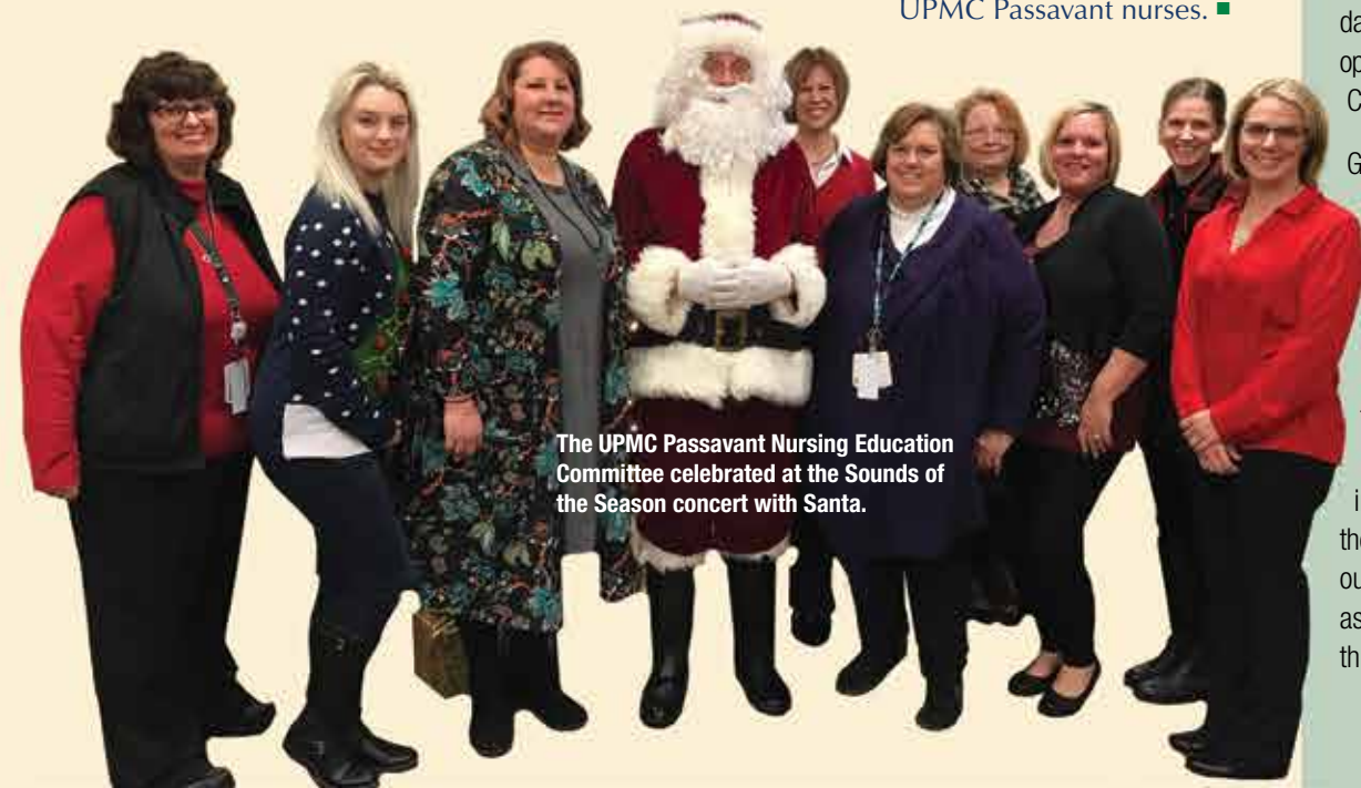
The UPMC Passavant Nursing Education Committee celebrated at the Sounds of the Season concert with Santa.

This year, the Fund disbursed $5,145 to assist 14 nurses in gaining certification in their area of expertise. Since the Nursing Education Fund's inception in 2014, it has funded $36,507 in education and certification for 129 UPMC Passavant nurses. ■