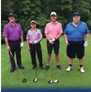
The Foundation's 31st Annual Golf Outing netted a record-breaking $137,000.