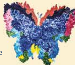
This butterfly was painted by the fingerprints of cancer survivors, guests and health-care givers at last year's UPMC Passavant Celebration of Survivorship.

A special take-away from the evening was a light-hearted, creative and resourceful 19-month calendar with tips, recipes and inspirational quotes for cancer survivors. ■